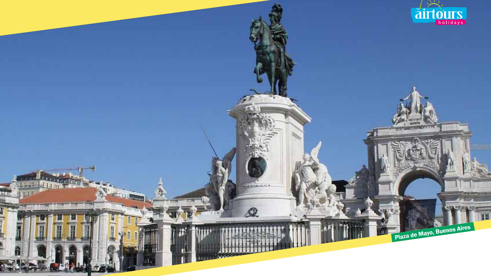
Plaza de Mayo, Buenos Aires