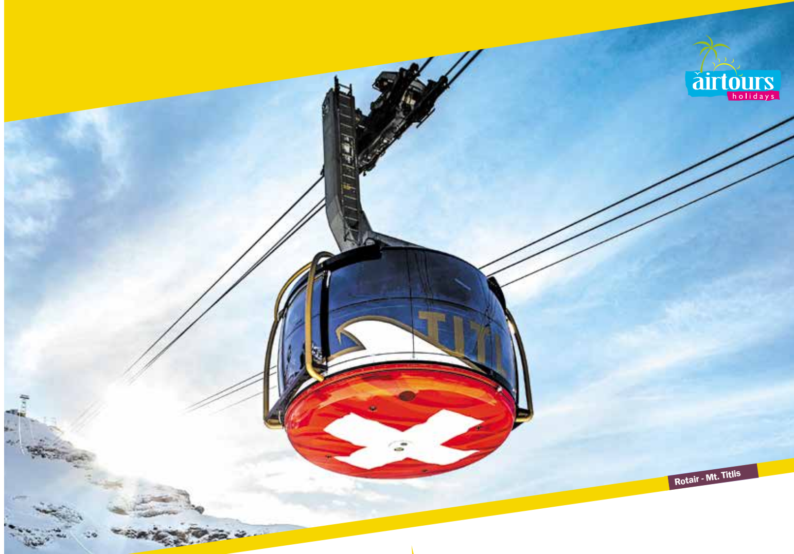
Rotair - Mt. Titlis

which takes you to a height of 3,454 metres to reach Jungfrauoch! This is a trip to another world – a wonderful world of eternal ice and snow. Experience the magic of the mountains and visit the Ice Palace on top of the longest glacier in the Alps & also the Sphinx. Today enjoy a Champagne lunch. Later, we visit Interlaken, a charming city nestled between two lakes and surrounded by the splendid Bernese Oberland Mountains. Thereafter, drive back to your hotel. Tonight enjoy an Indian dinner