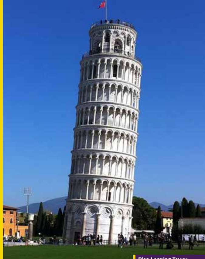
Pisa Leaning Tower

Baptistery, the Campanile and marvel at the open air sculpture museum in Piazza della Signoria and many more sights. Also, see the Ponte Vecchio - a medieval bridge over the River Arno. After an Indian lunch, drive to Rome. Tonight enjoy a local dinner . Check into your hotel.